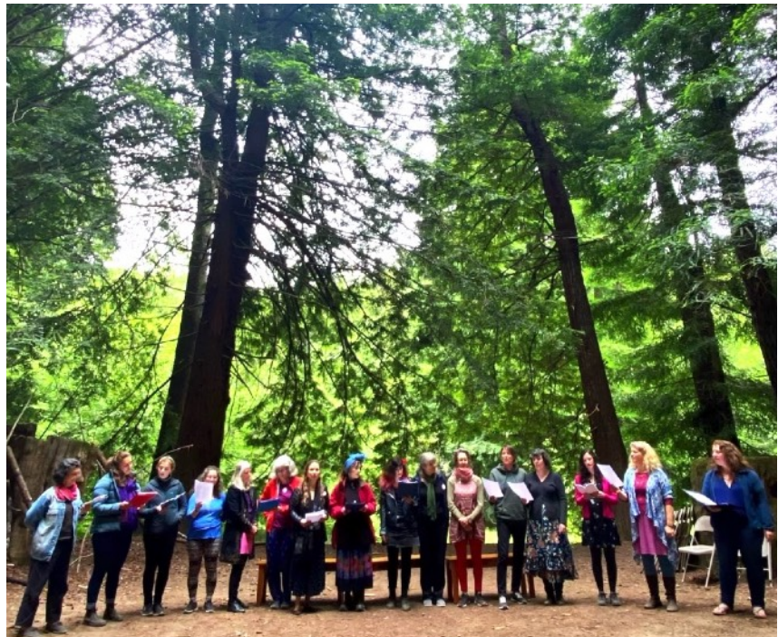
Singing under the towering redwoods at Mendocino.