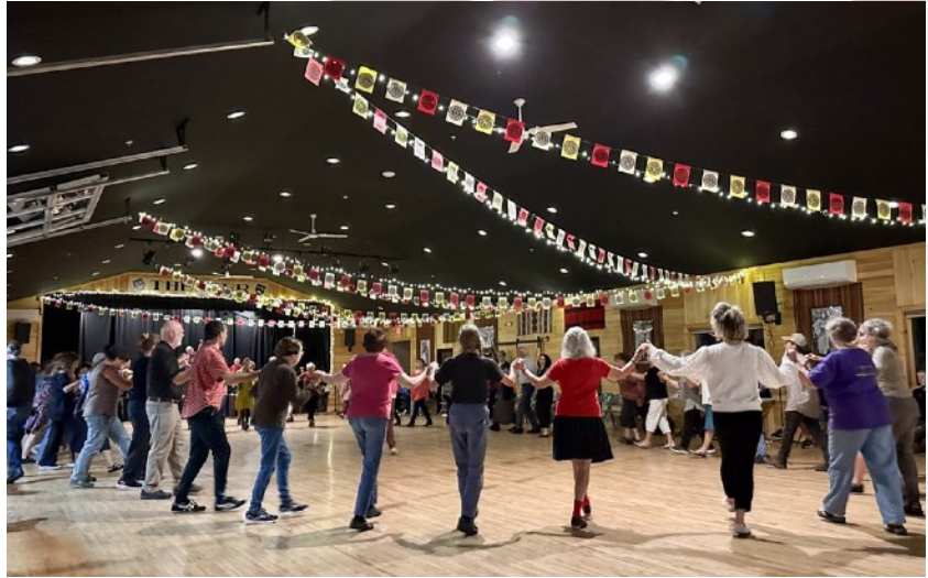
Dancing the night away at Iroquois Springs.

Our workshops and online offerings may be magical, but they don't run themselves. We extend our deep gratitude to the community members who stepped in to moderate, translate, offer technical expertise, serve meals, tally auction bids, run Kafana orders, help a confused new camper find their way around and feel welcome . . . and perform the myriad other unsung tasks that make our classes and camps work. We also wish to thank the non-board volunteers serving selflessly on many of our organizational committees, remembering that EEFC Board members are volunteers themselves. We love you!